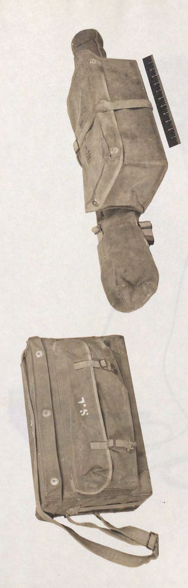
SIGNAL LAMP EQUIPMENT SE-8-T2 PACKED FOR TRANSPORTATION